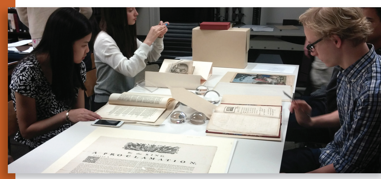
Students from the Dalton School review a document from the Gilder Lehrman Collection